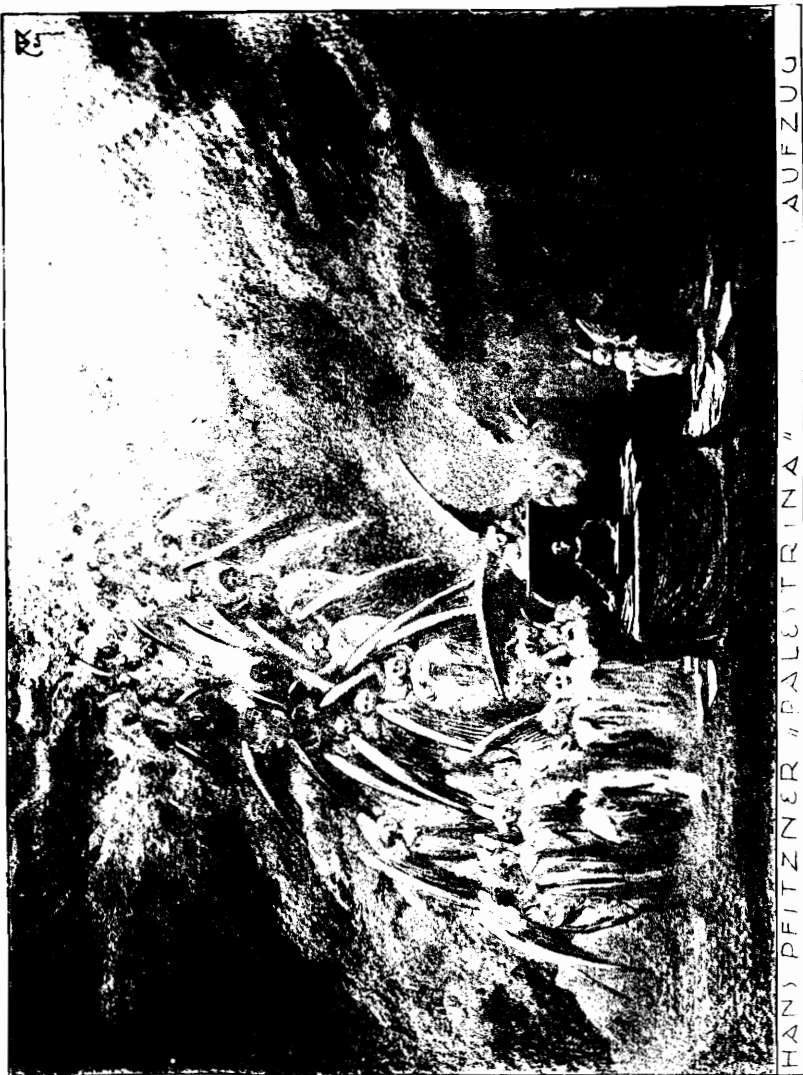
HANS PFITZNER "PALSTRINA" I. AUFZUG