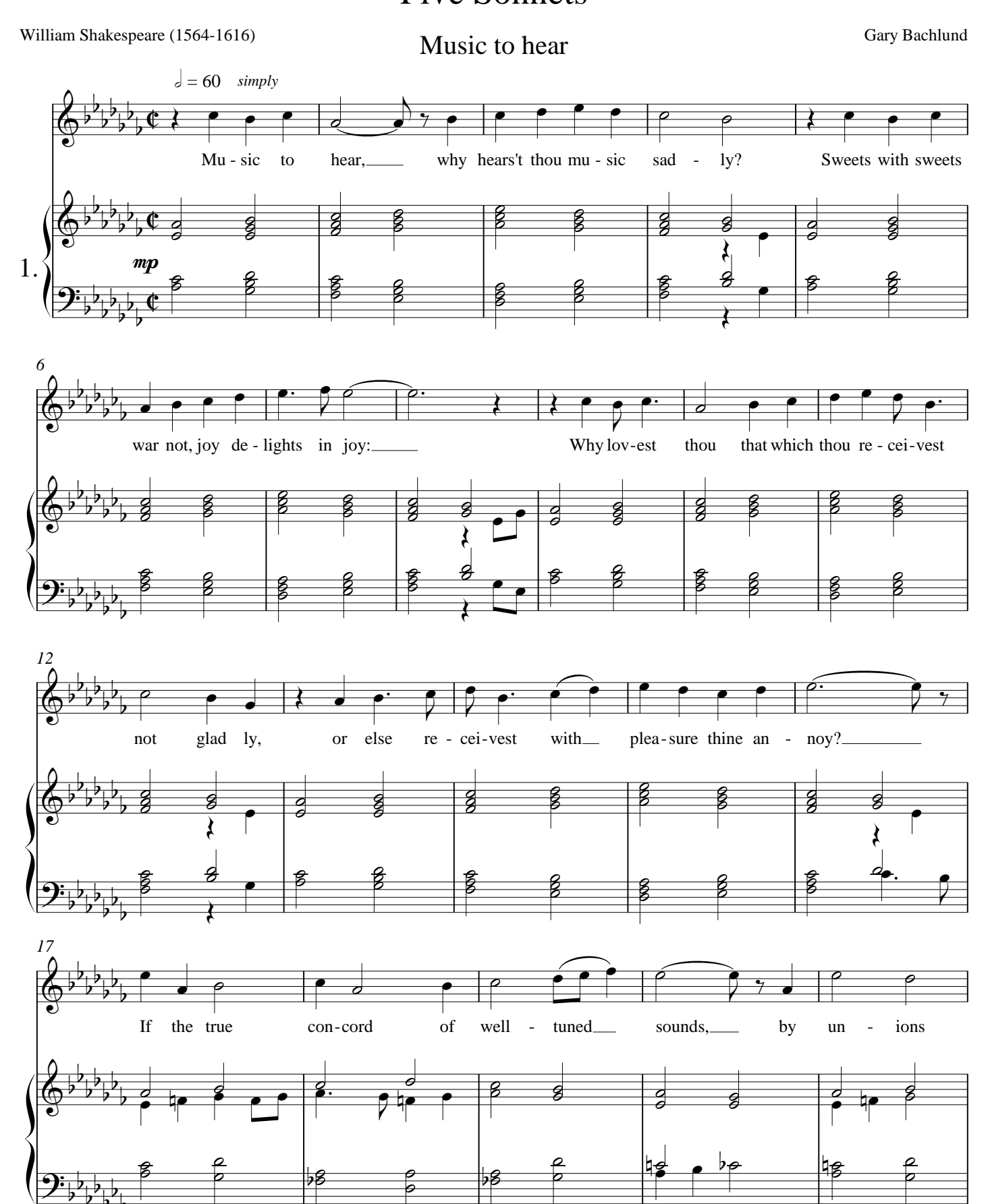
Copyright © 2000 Gary Bachlund All international rights reserved. www.bachlund.org