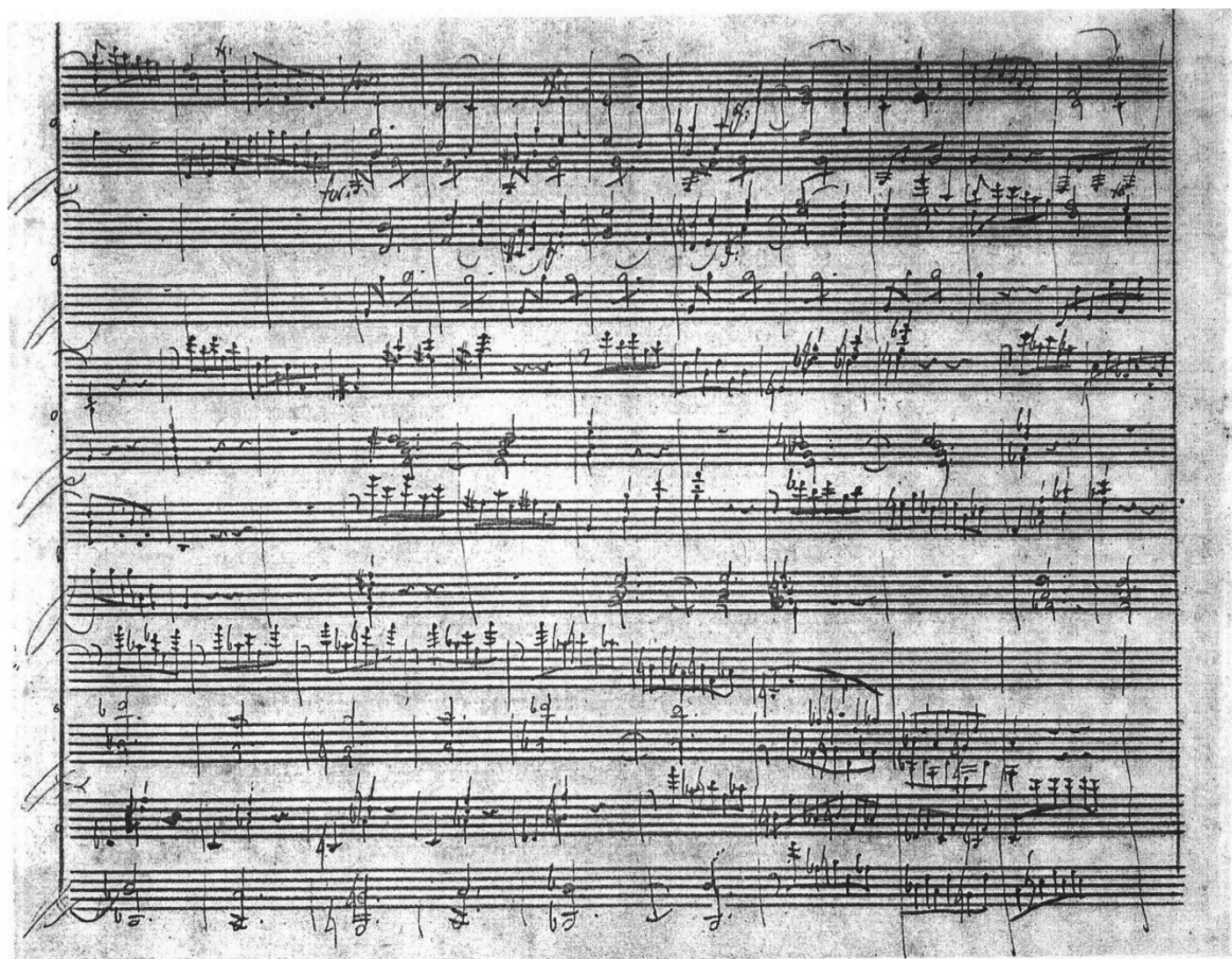
Leaf 1 (verso)