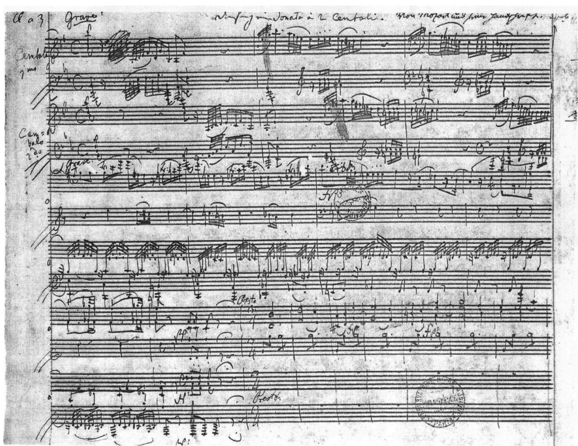
Leaf 1 (recto)

Bibliothèque nationale de France Paris, Département de la Musique