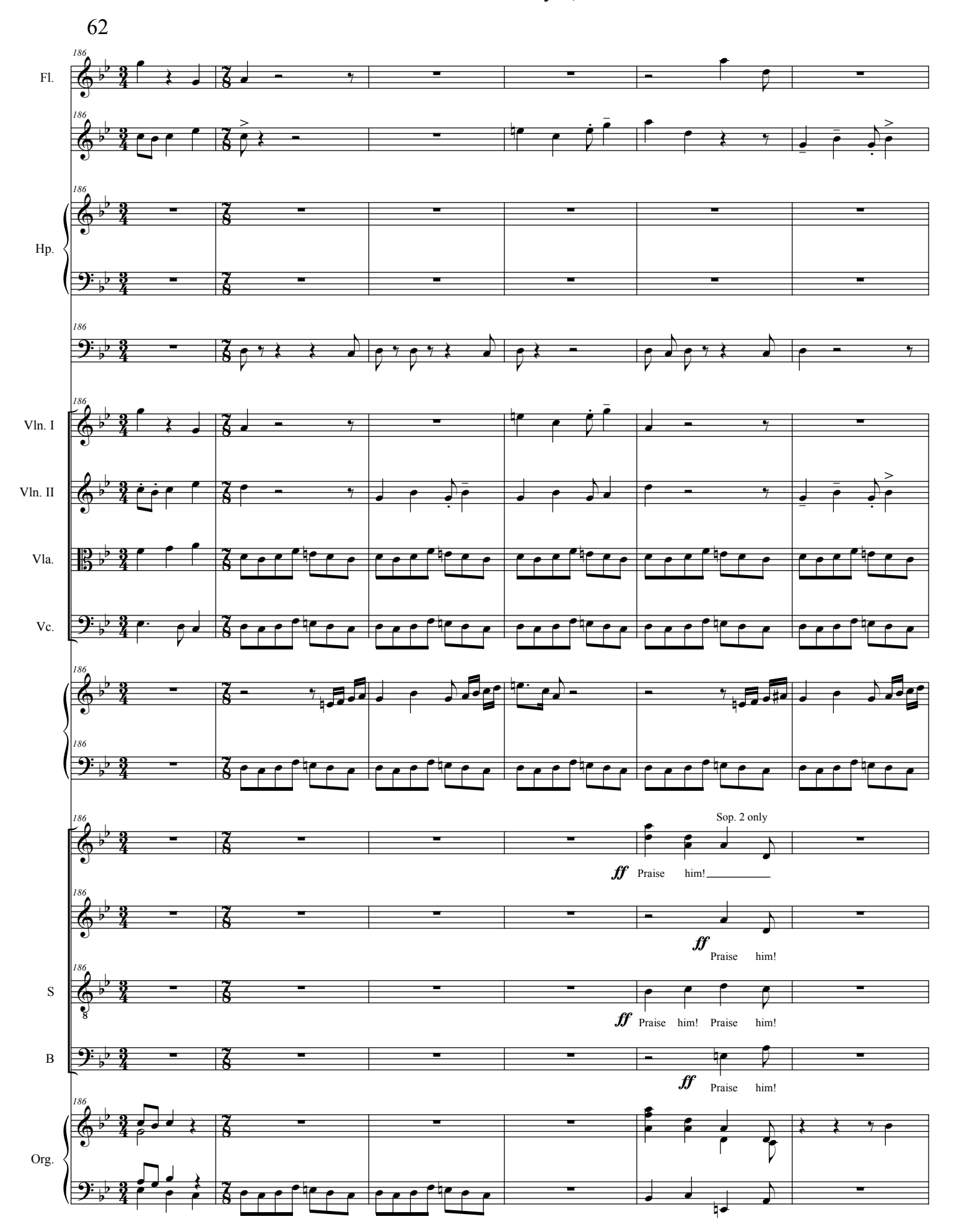
A Proclamation and a Prayer, Nos. 2 & 3