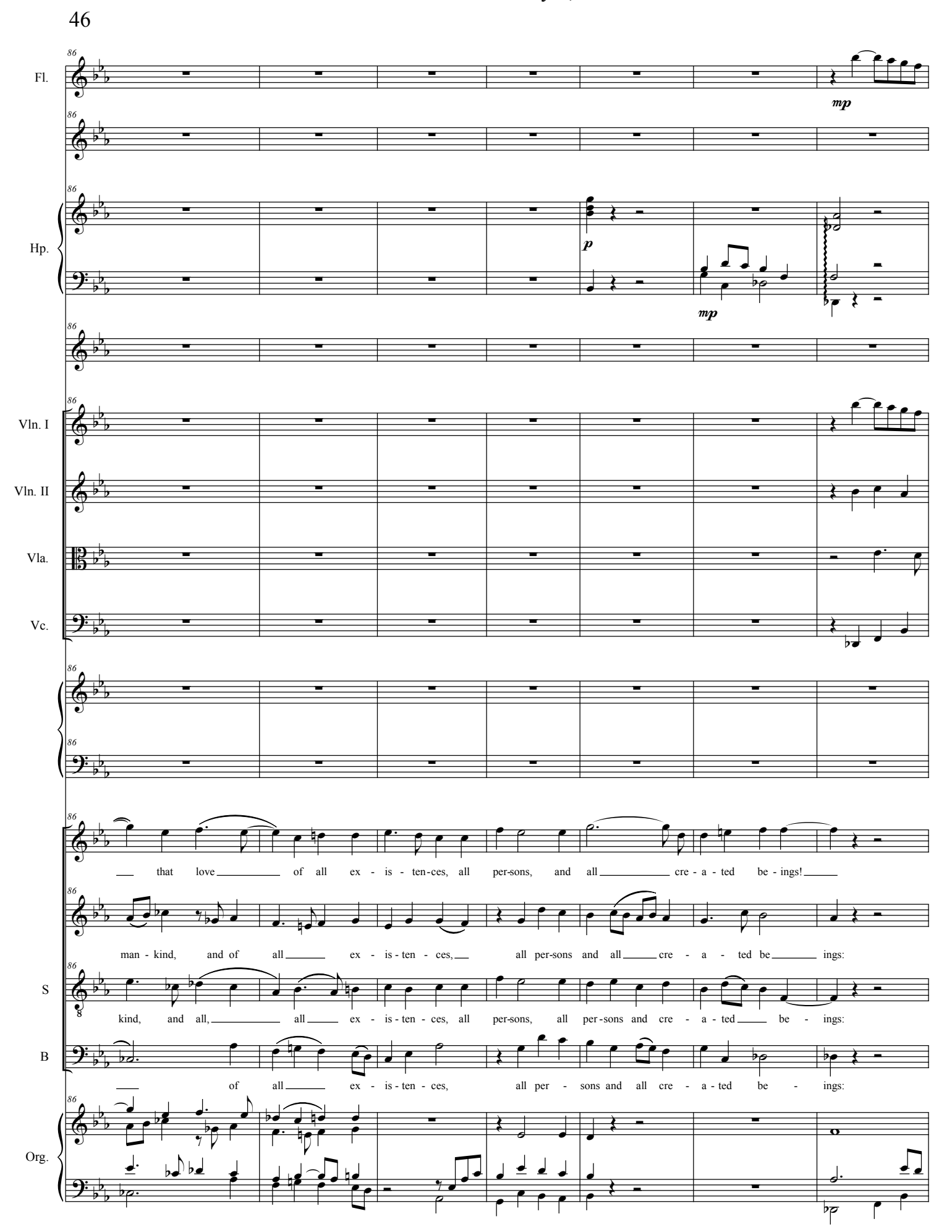
A Proclamation and a Prayer, Nos. 2 & 3