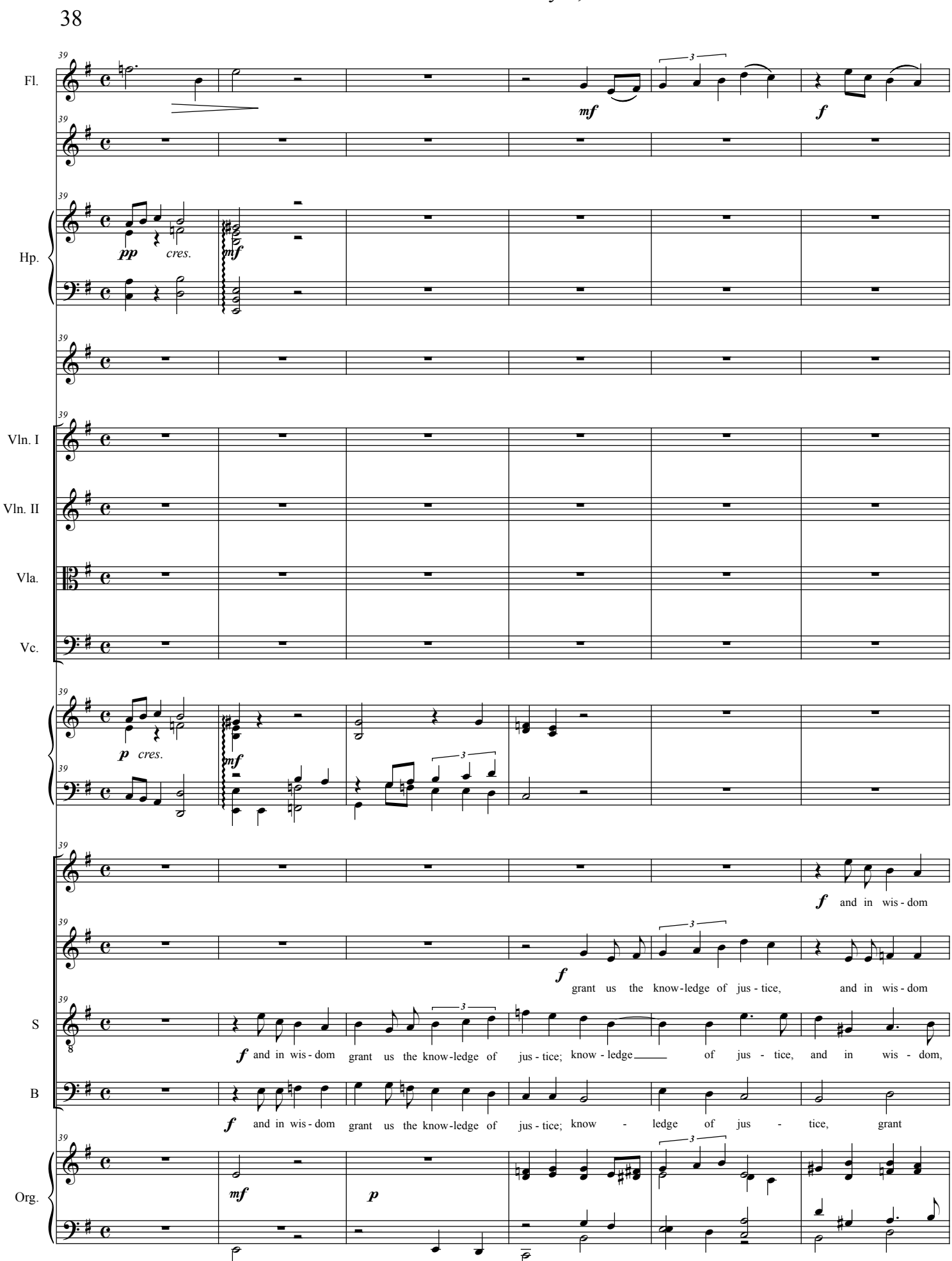
A Proclamation and a Prayer, Nos. 2 & 3