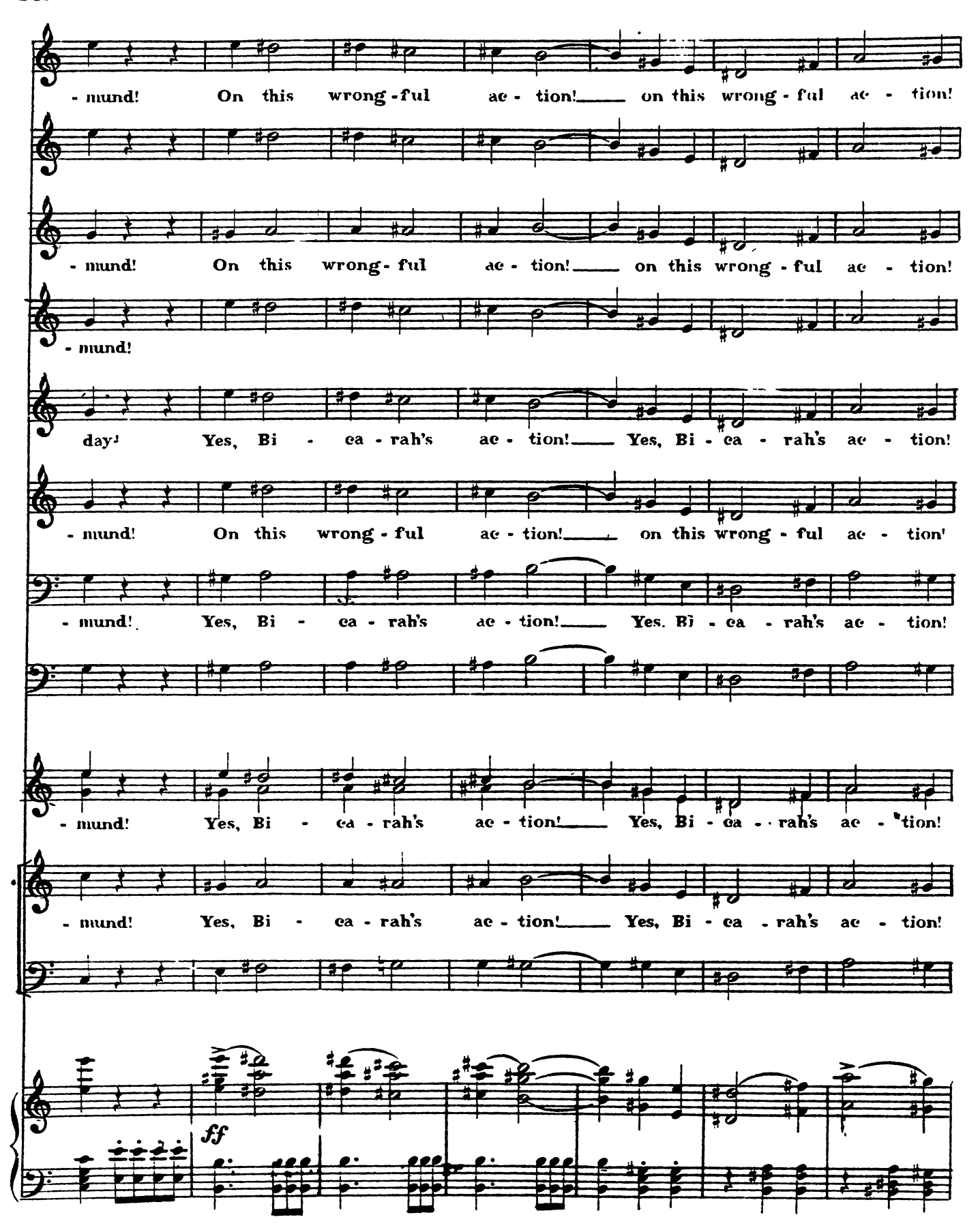
W. S. & CO. 5102 + 173