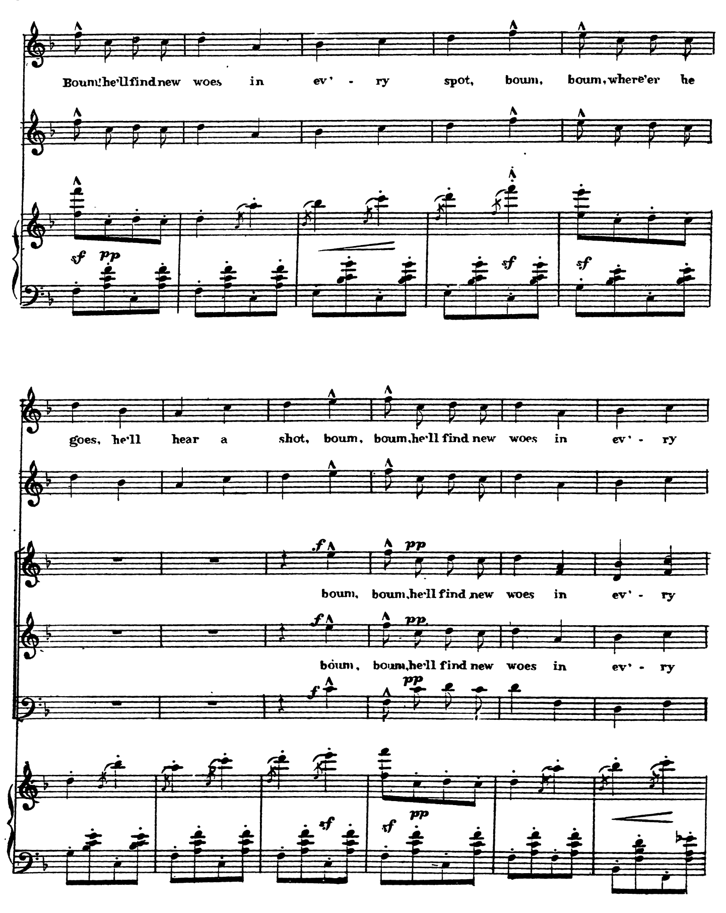
W.S.& CO. 5102 + 173