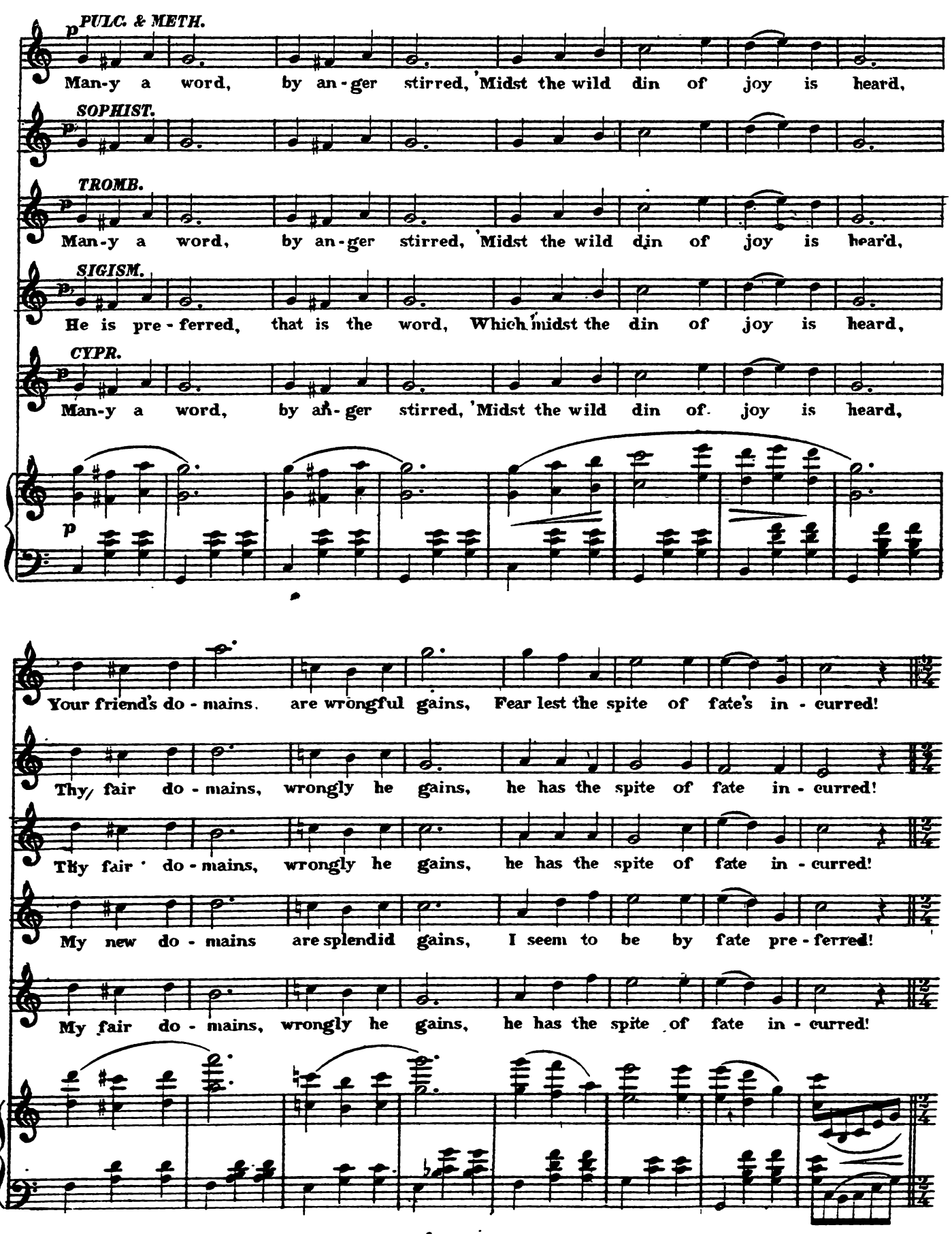
W.S. & CO. 5102 + 173