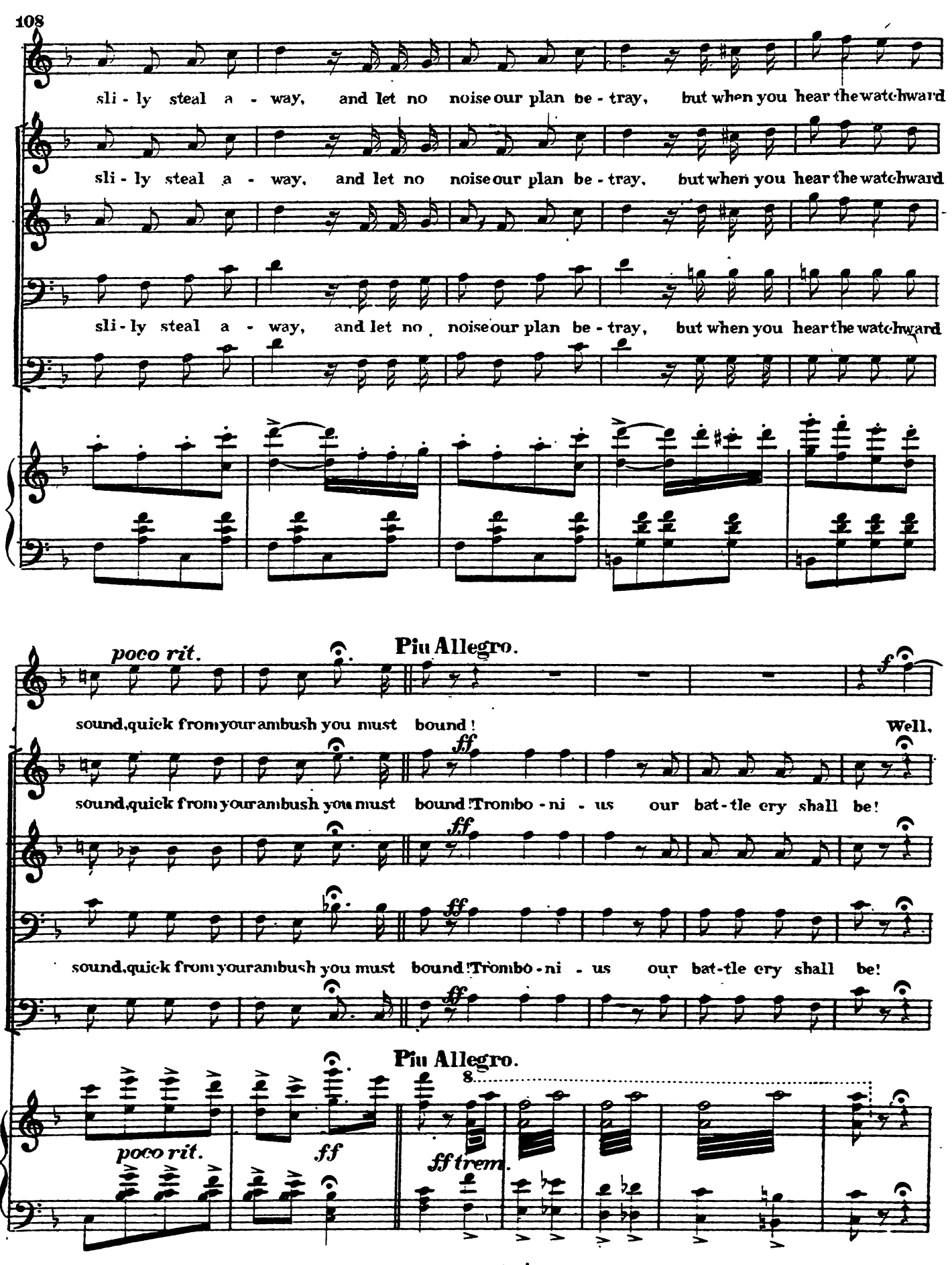
W. S. & CO. 5102 + 173