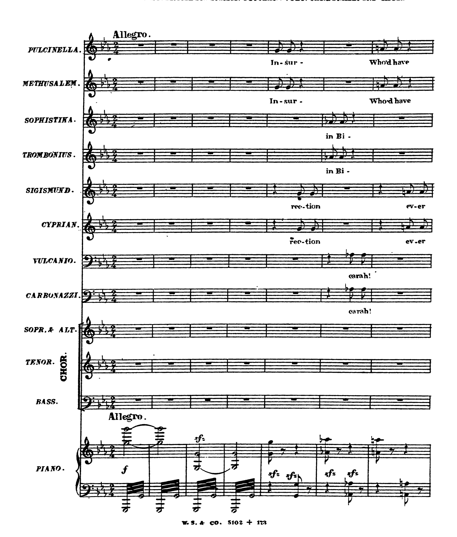
PULC. METHUS. SOPHIST. TROMBON. SIGISM. CYPRIAN. VULC. CARBONAZZI and CHOR.