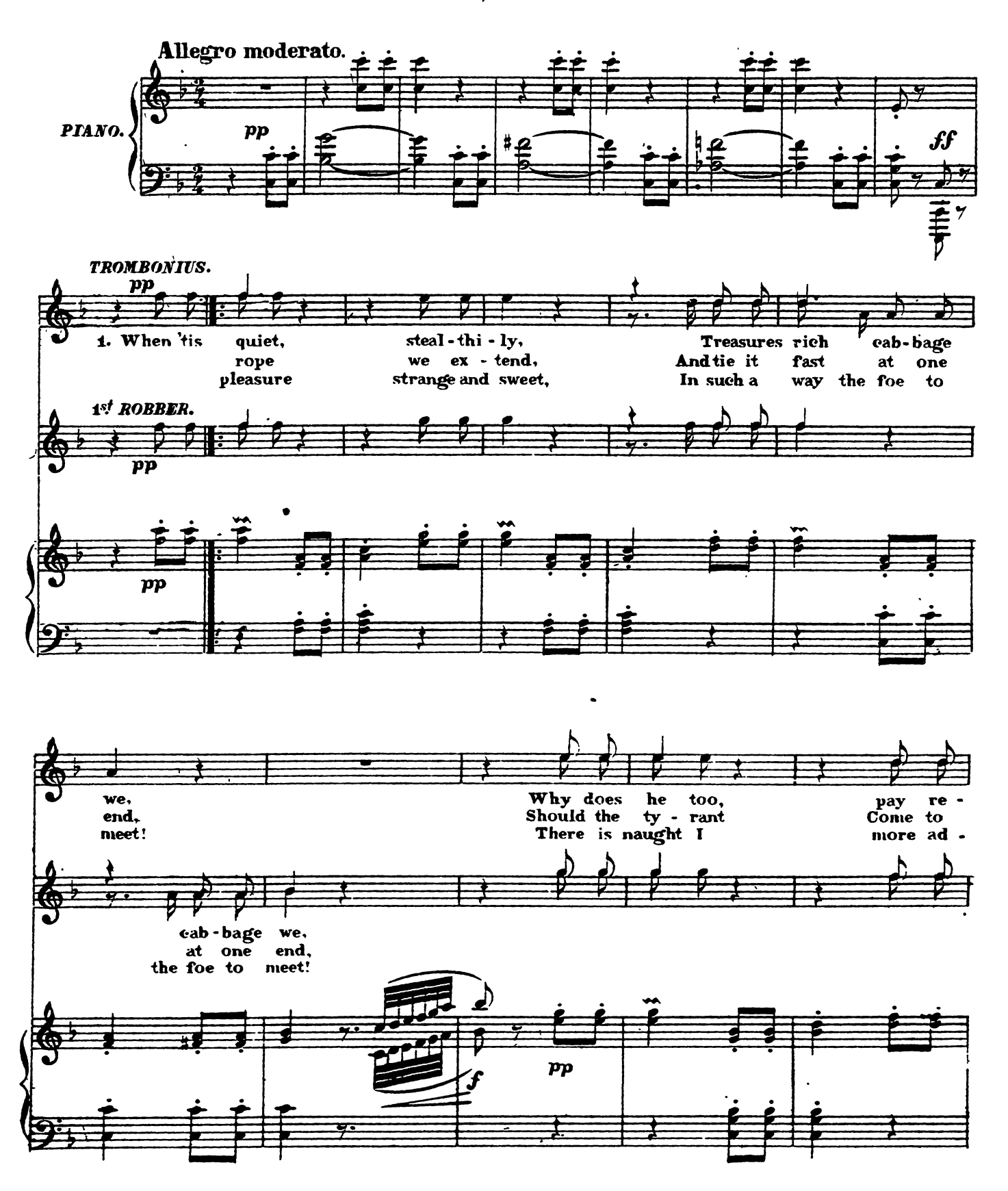
№ 17. DUET and CHOR. TROMBONIUS, 1st ROBBER & CHOR.