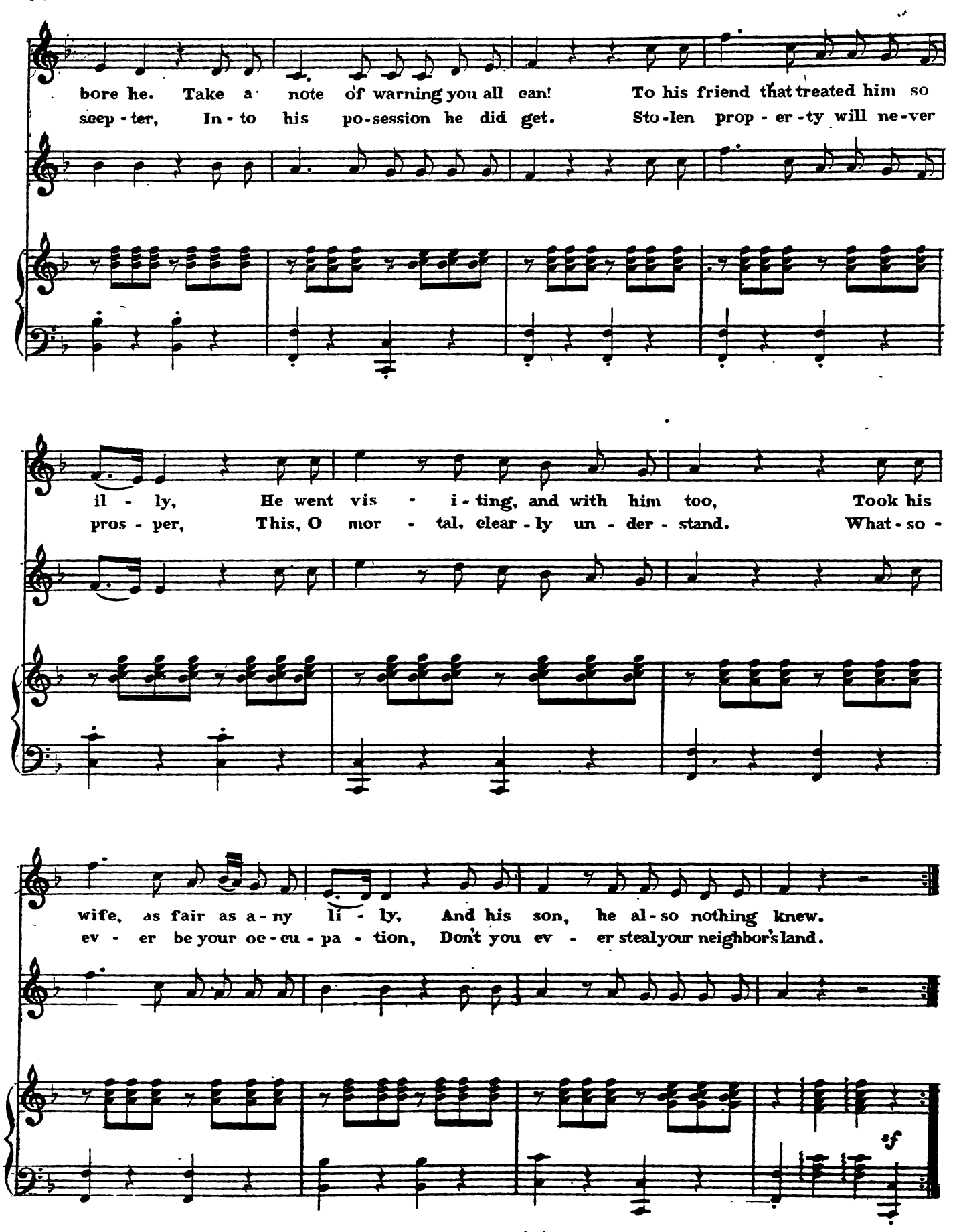
w. s. & co. . 5102 + i73