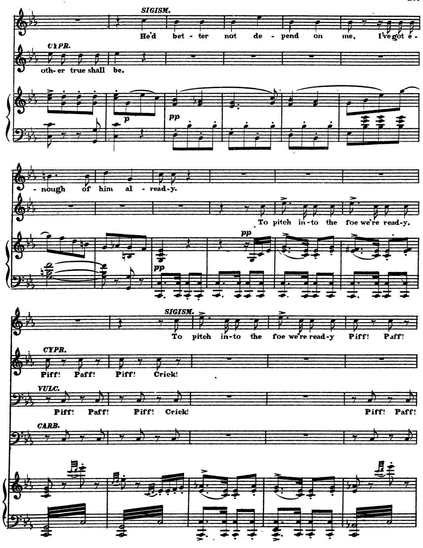
W.S.& CO. 5102 + 173