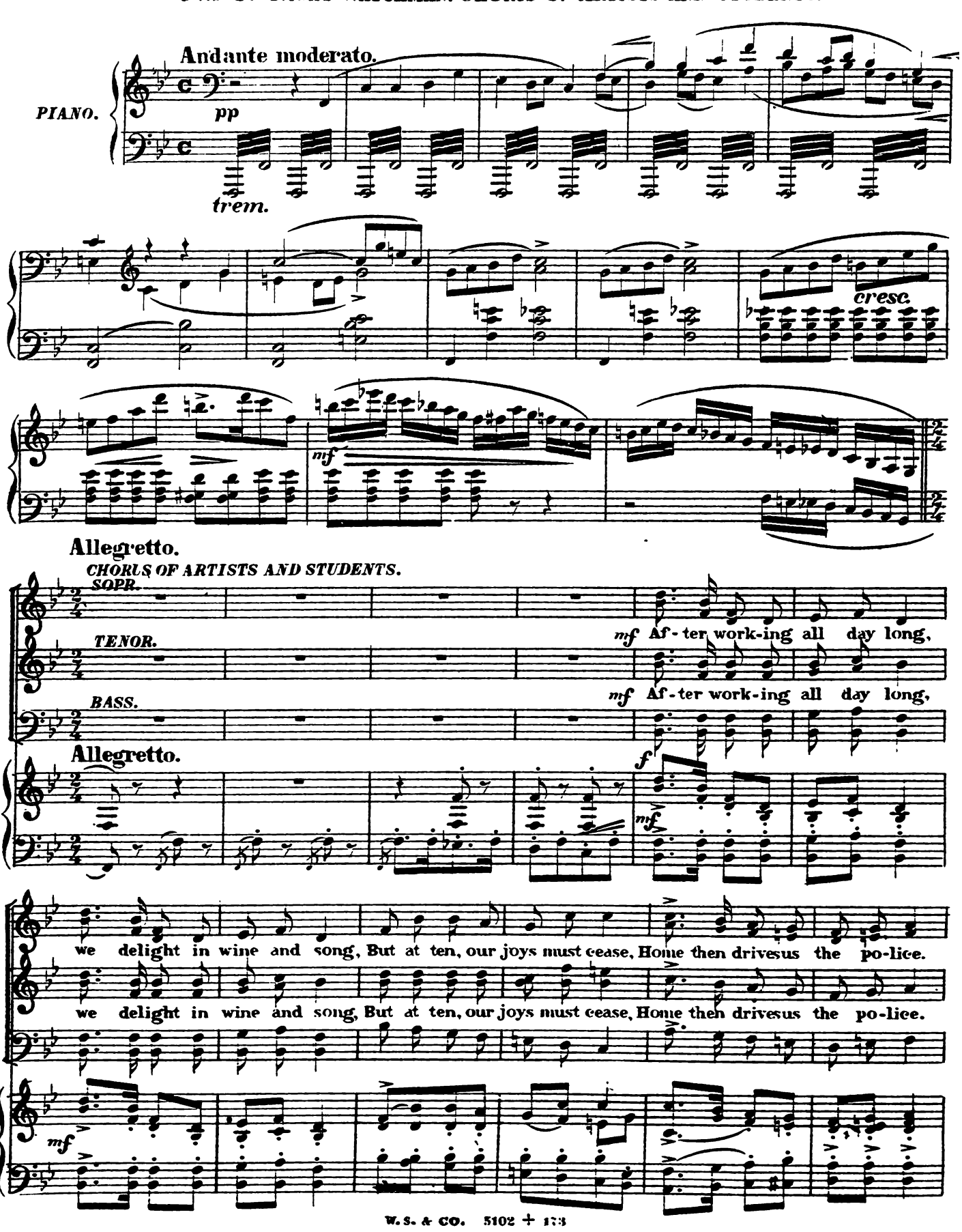
№ 8. NIGHT-WATCHMAN. CHORUS OF ARTISTS AND STUDENTS.