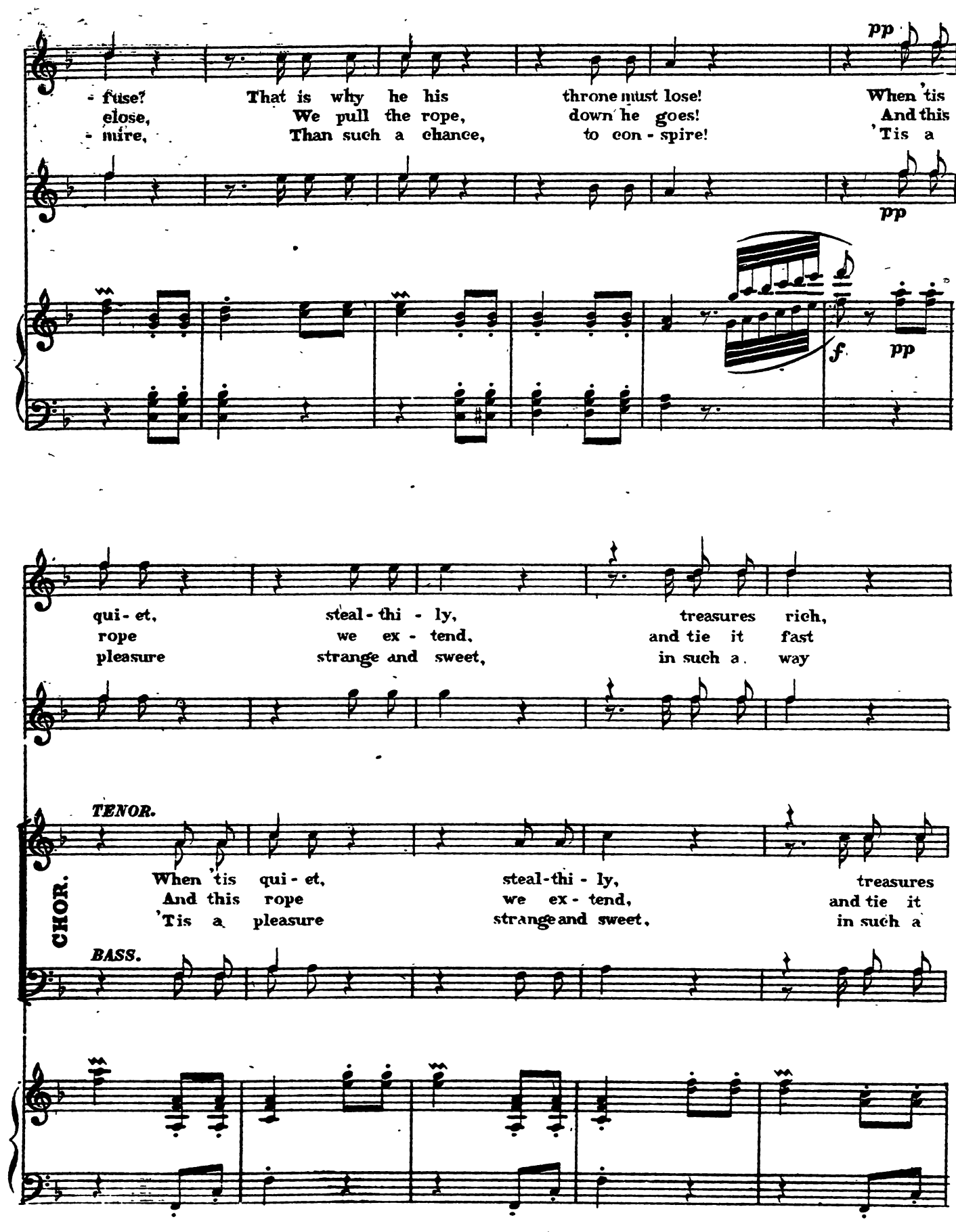
W. S. & CC. 5102 ' 173