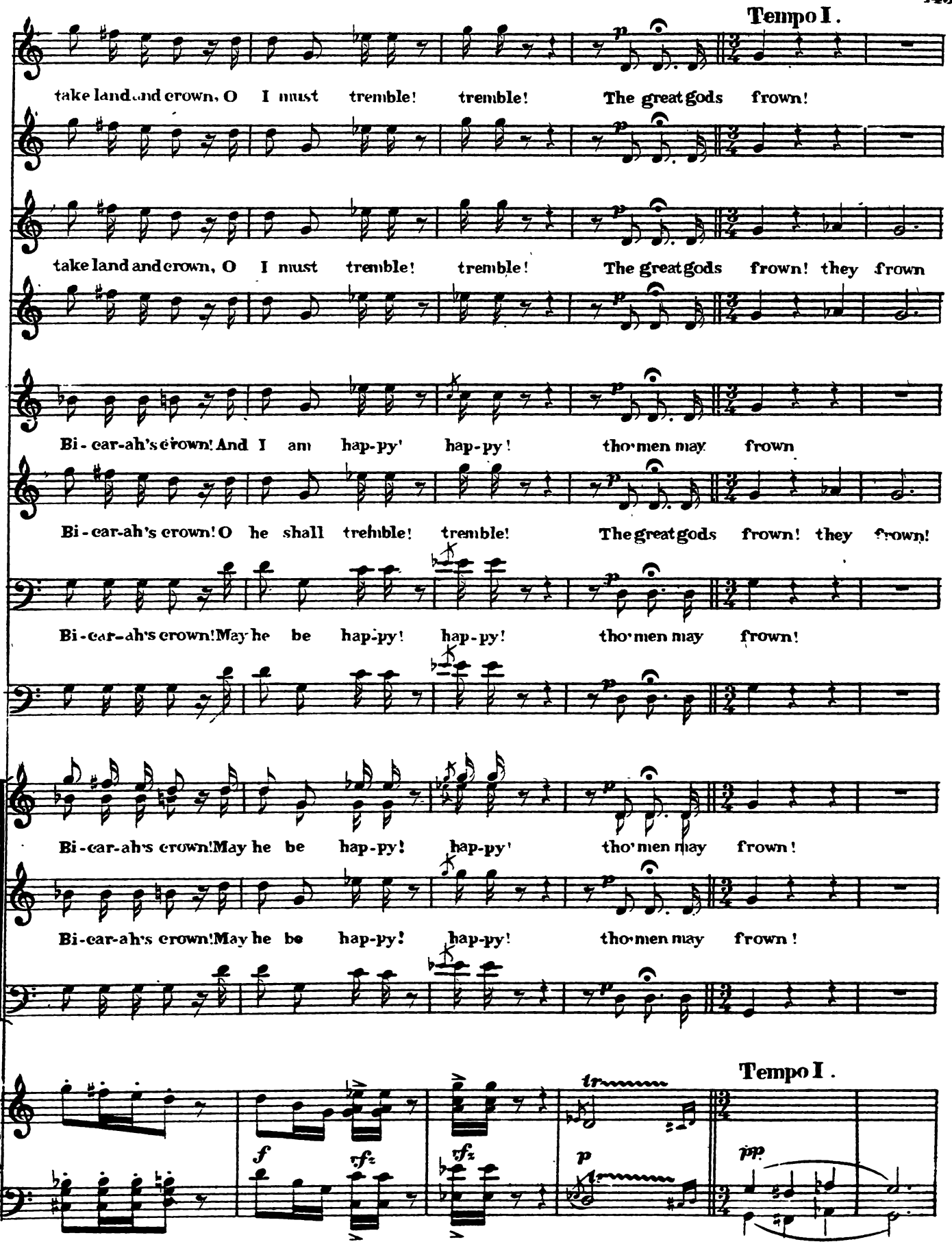
w. s. & co. 5102 + 173