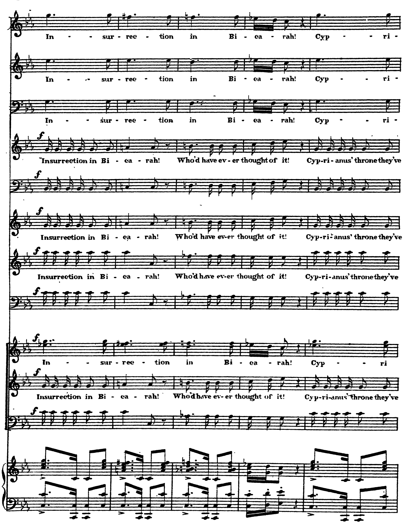
W.S.& CO. 5102+173