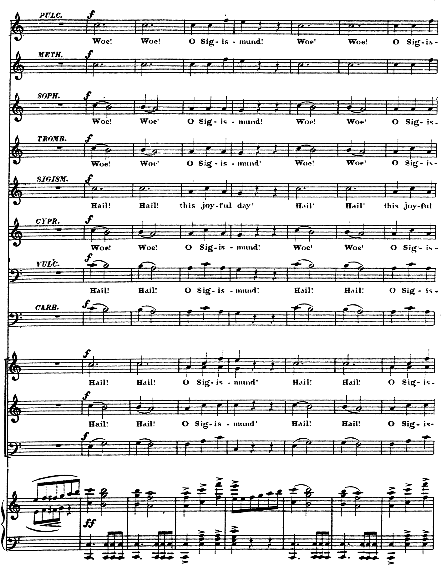
W. S. & CO. 5102+173