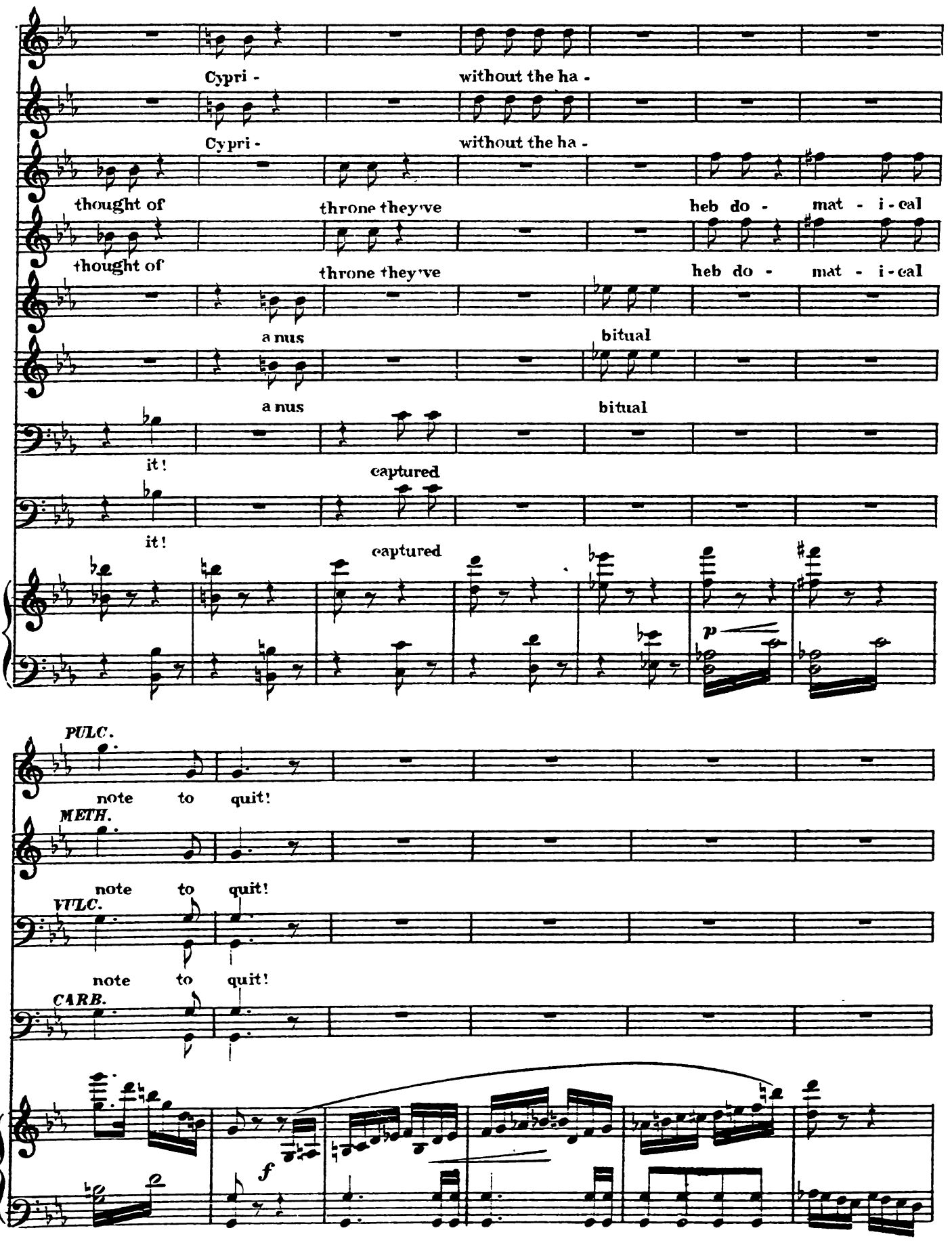
W. S. & CO. 5102 + 173