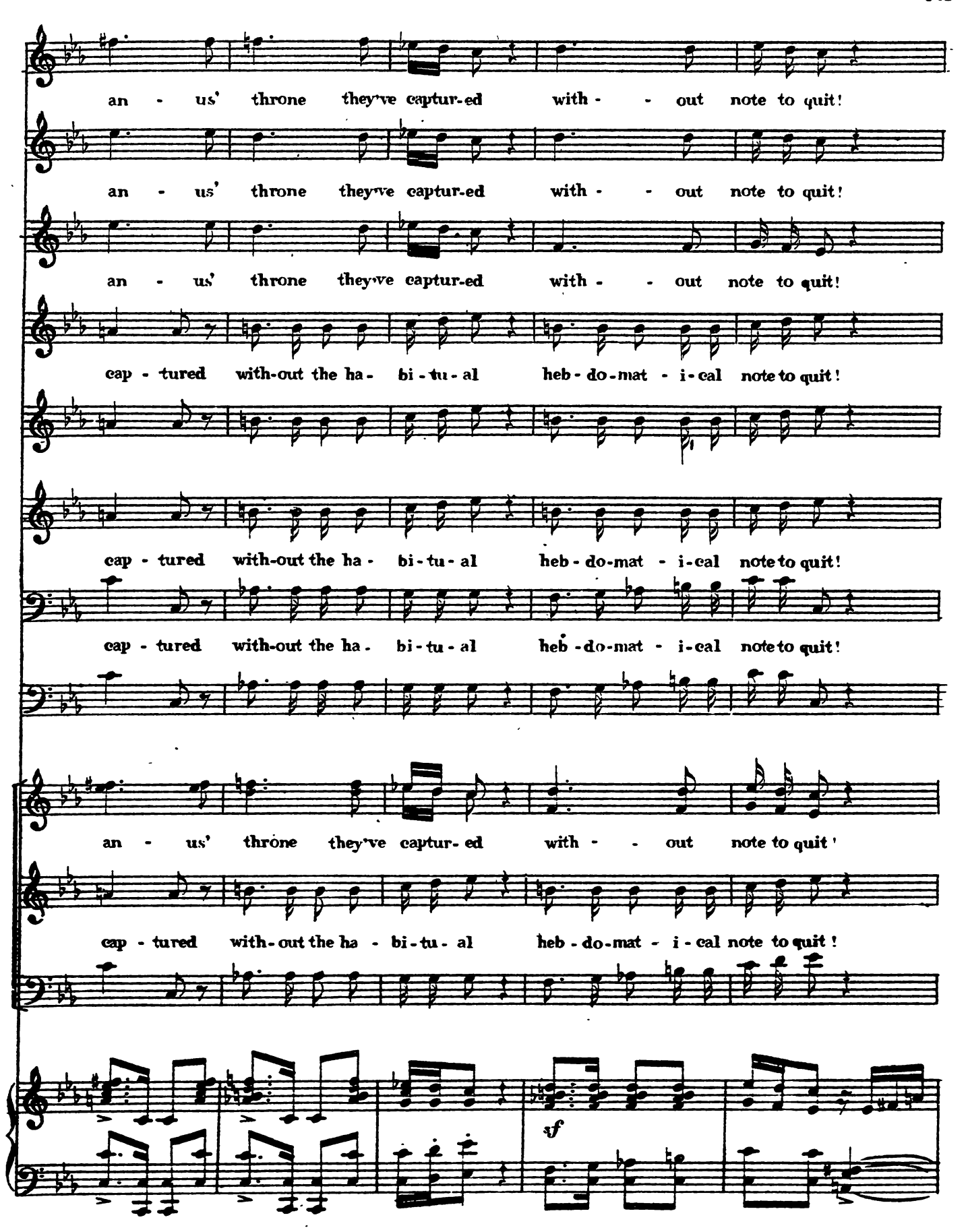
W. S. & CO. 5102 + 173