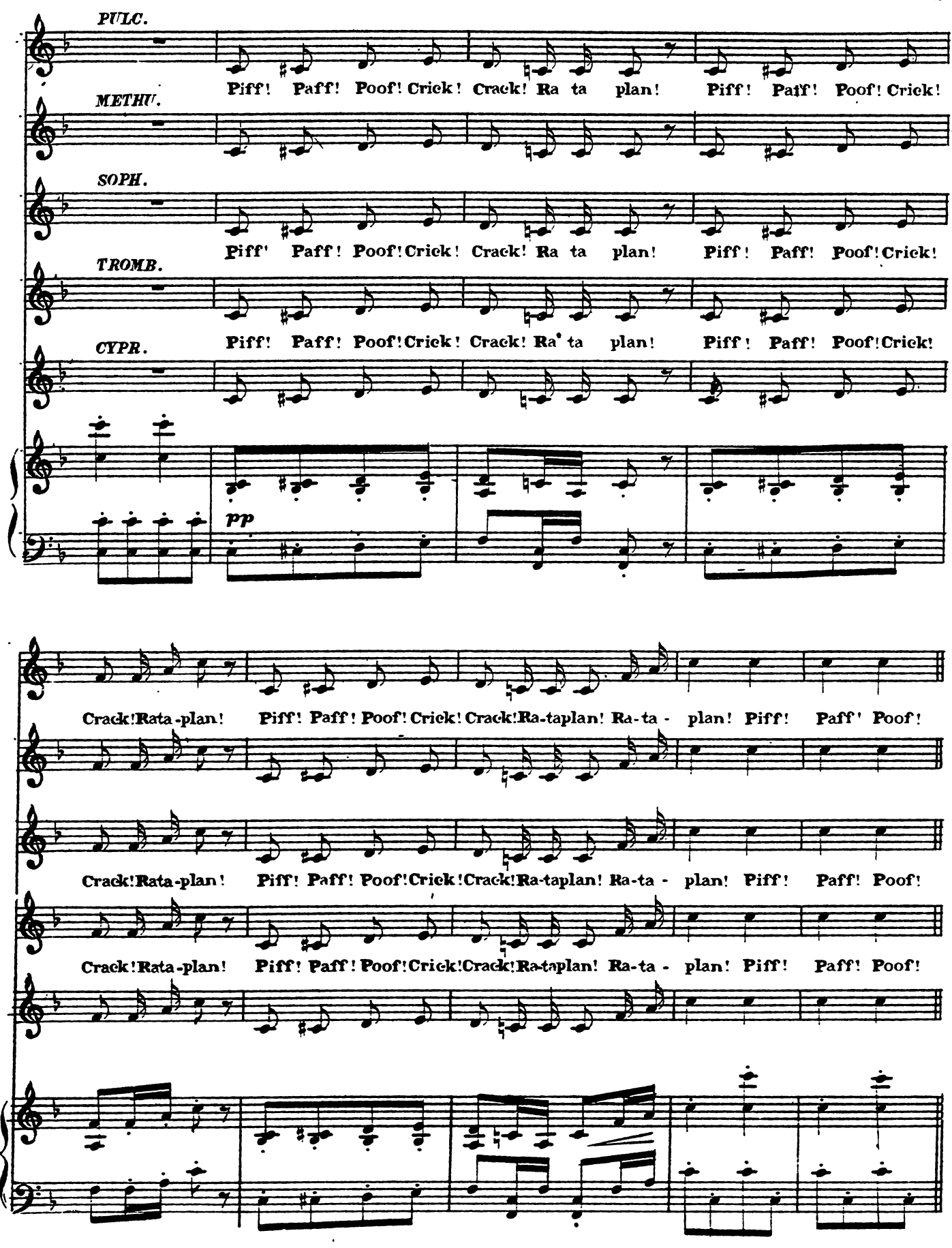
W. s. 4 CO. 5102 + 173