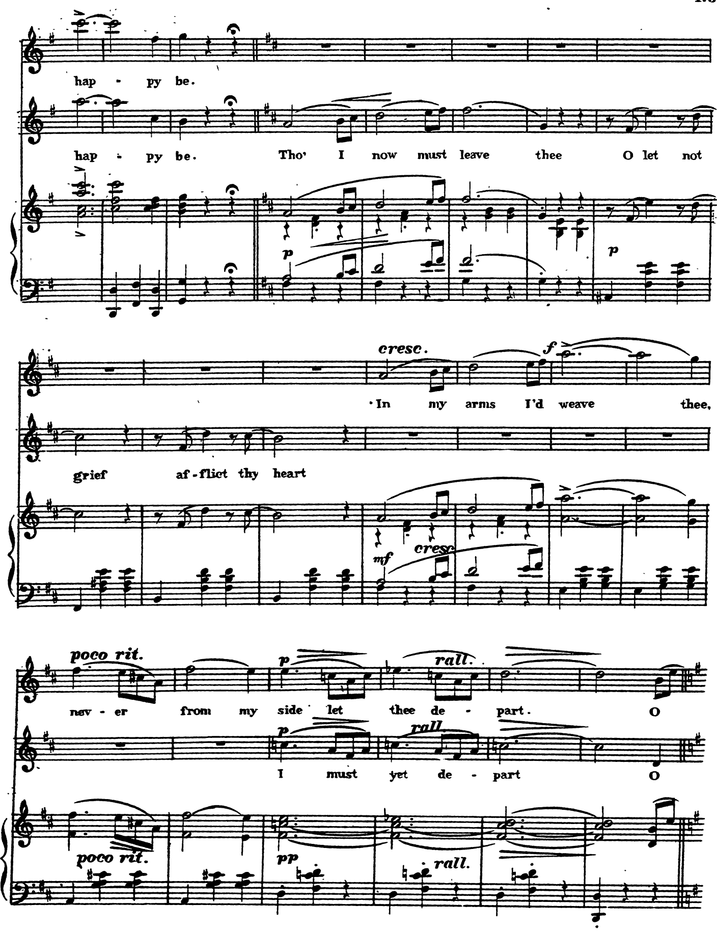
W. S. & CO. 5102 + 173