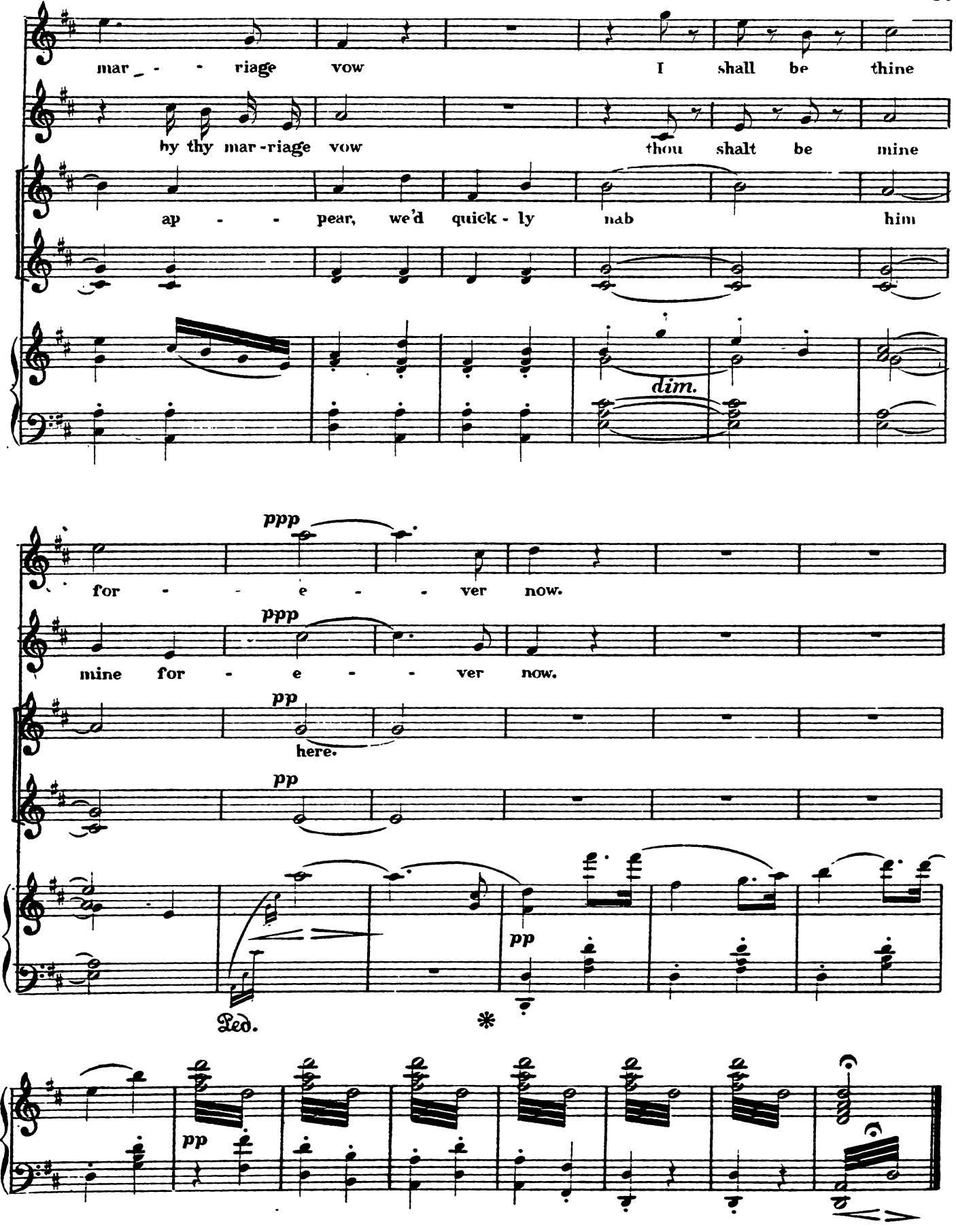
W, S. & CO. 5102 + 173