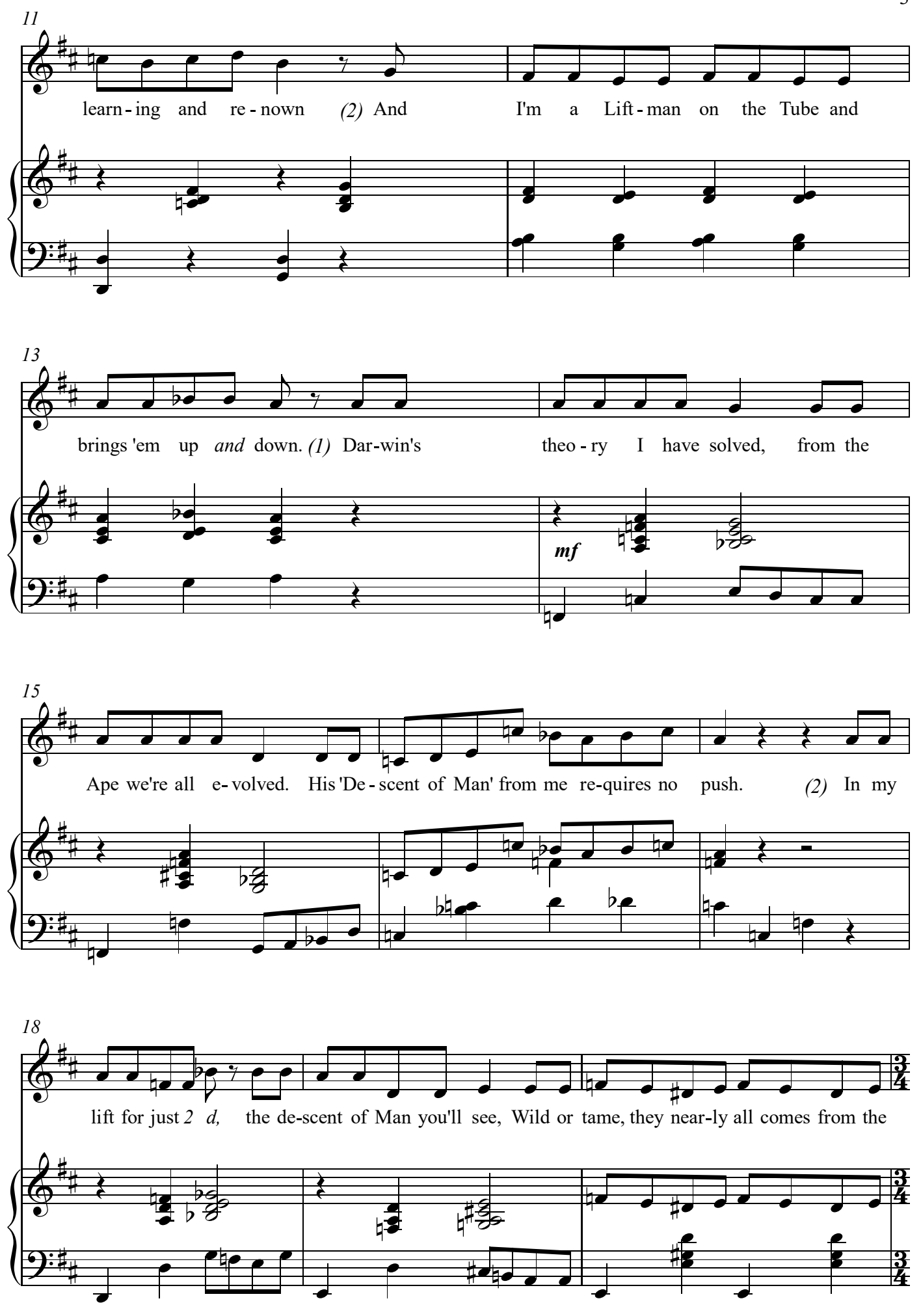
R & Co: 1085